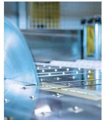
Symbol photos.